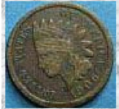
1900 Indian Head Cent

September 9-12 Six Nations Fall Fair Competition Powwow Ohsweken Contact: 1-866-393-3001 or email jsandy@sixnations.ca